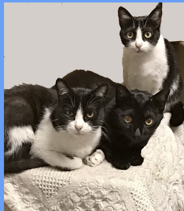
Ranger, Goliath and Bessie